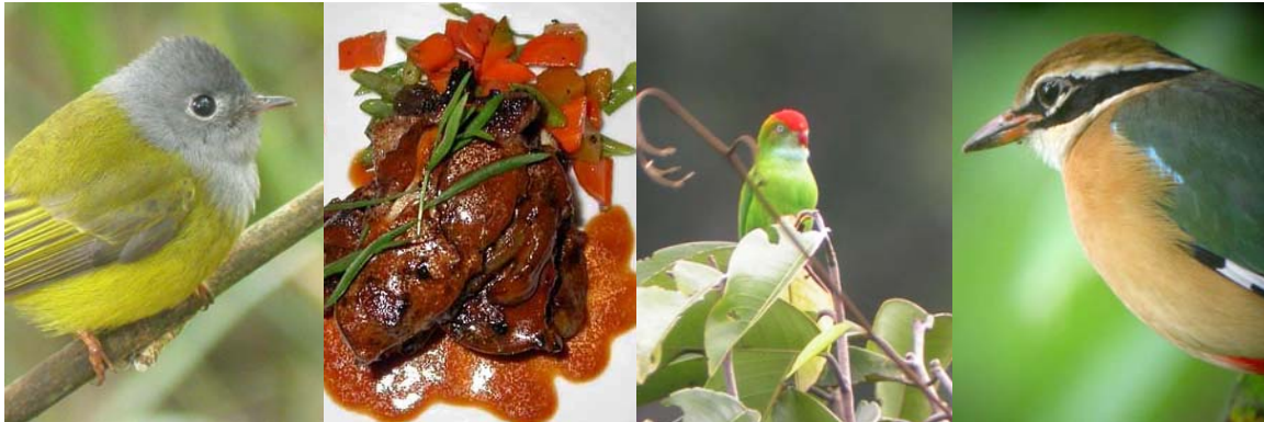
Grey-headed Canary Flycatcher

We will return for to enjoy a fine dining style dinner at the Hunas Falls Hotel.