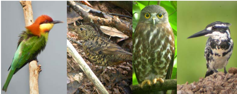
Chestnut-headed Bee-eater Sri Lanka Scaly Thrush Brown Hawk Owl Pied Kingfisher

A final log & a fine farewell dinner at the hotel's specialty Chinese restaurant will mark the end of this exciting birding holiday.