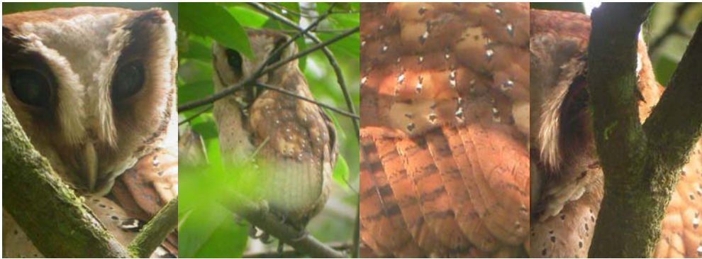
'Sri Lanka' Bay Owl, in a day roost discovered in Jan 2007

Amila's Birding & Wildlife Blog: Gallicissa...a birder in an endemic hotspot