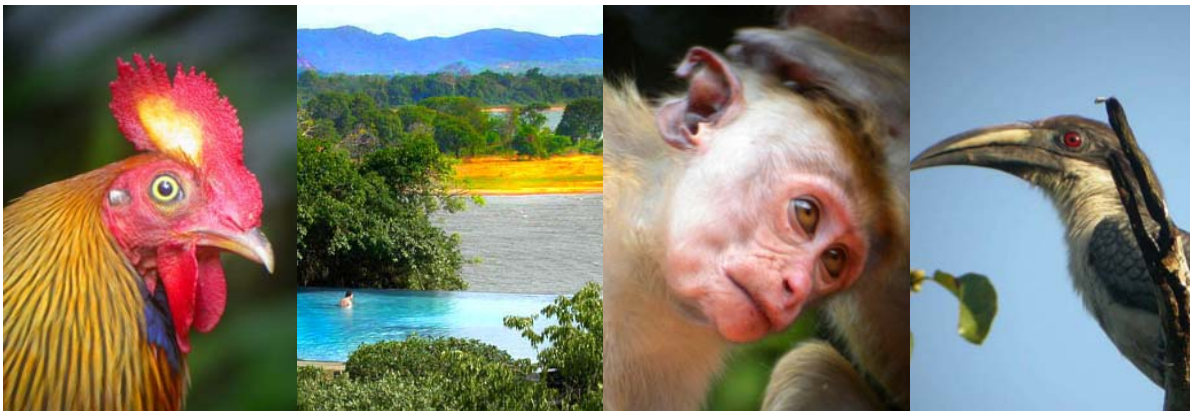
Sri Lanka Junglefowl Infinity pool, Heritance Kandalama Toque Macaque Sri Lanka Grey Hornbill

Thereafter you will be at leisure to enjoy this magnificent hotel & to take advantage of the various facilities. You will again be met by Amila at 2.45 p.m. for the afternoon excursion to Sigiriya Rock Fortress which is popularly believed to be the pleasure capital of a single king called Kashyapa in the 5 th century A.D. A UNESCO World Heritage site, this inselberg rises 200 m above the surrounding forested plains of the Sigiriya Sanctuary, which holds good birds. The more energetic could scale the Sigiriya rock for cultural explorations interrupted by regular birding distractions. We will descend in time for some quality late afternoon birding in the Sigiriya Sanctuary until dusk to include some crepuscular birding before heading back to Heritance Kandalama to end an enjoyable birding & cultural day after a another fine buffet dinner.