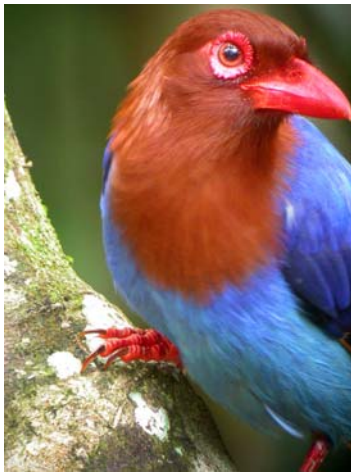
Sri Lanka Blue Magpie

A 17 day birding holiday with a difference with Amila Salgado - Birdwing Nature Holidays